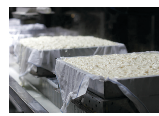
Making tofu.

is glucono delta-lactone (GDL). GDL is specifically used for silken or soft tofu because it coagulates rapidly, allowing silken tofu to be made inside the container without an air-gap, which prevents the silken tofu from breaking during transport. Prior to the invention of GDL and its use in silken or soft tofu, tofu makers couldn't reliably transport soft tofu. GDL is commonly used with soy milk having high solids levels (10%-13% instead of 5%-10% in regular tofu). Soft and silken tofu filled containers are heated in a water bath at 80°C-90°C for 40 to 60 min to allow the GDL to transform into gluconic acid, which causes the protein to coagulate as a homogeneous gel, with no whey separation (Berk 1992). GDL